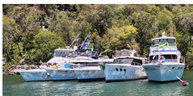
Some of the boats in Refuge.